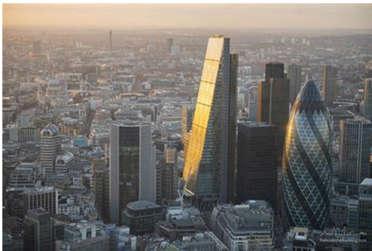
An events venue will open on the 42nd floor of the Cheesegrater

The Leadenhall Building in London, otherwise known as the Cheesegrater, is to open Level 42 as a dedicated events venue this summer.